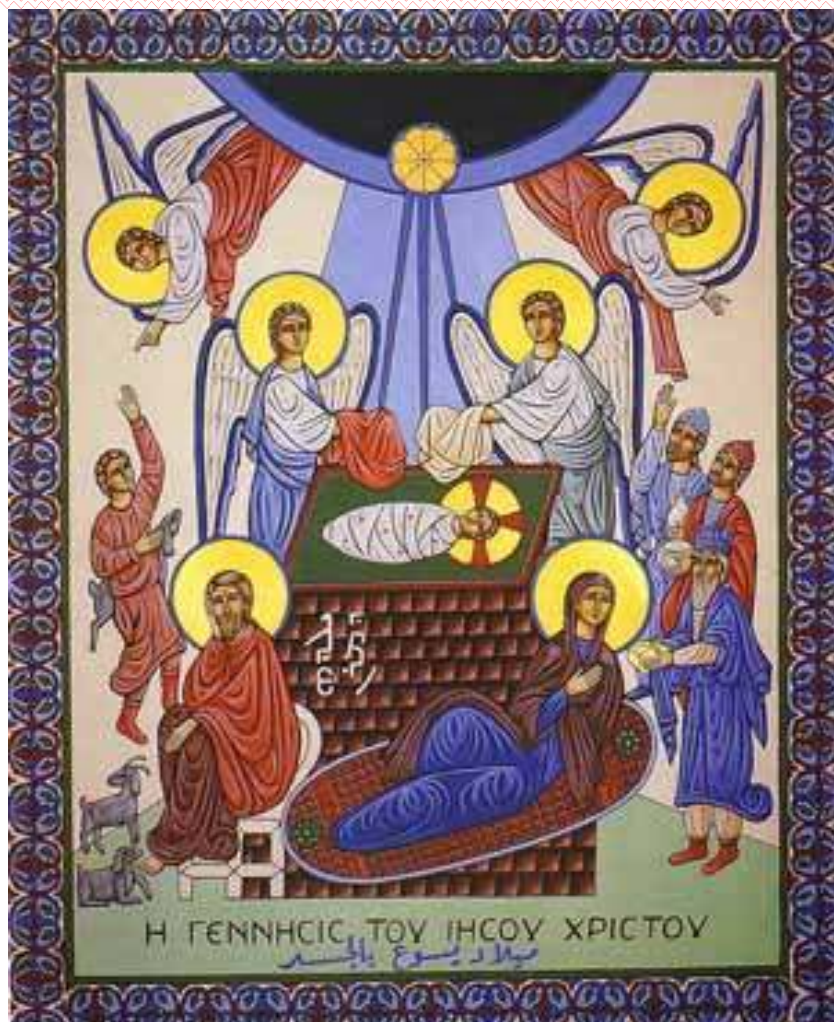
yaldèh d Moran – ميلاد يسوع المسيح Birth of Our Lord Nativité de Notre Seigneur